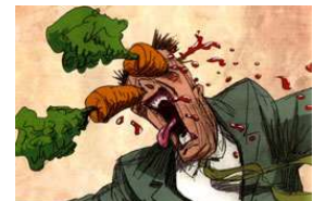
Sex & Violence 1997

Bill Plympton works as an independent filmmaker in New York. His films are adored in cinema festivals, on the public music channel MTV and by those who love irreverence. 1987 his film "Your Face" was nominated by the Hollywood Academy for an Oscar. In 2004 his 3 rd feature film "Hair High" was released.