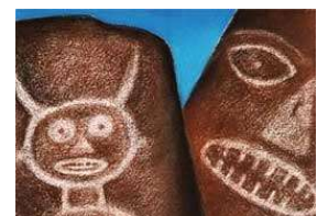
Ground Zero - Scared Ground, 1997