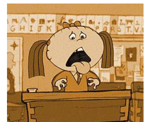
Give up Yer Aul Sin, 2001