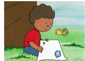
The Boy and the Bird 2004

In 1996 they fled the country and now they are living as approved asylees in Germany. Their latest short film "The Boy and the Bird" was produced in 2004.