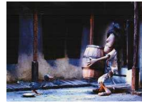
Caribbean Christmas, 2001