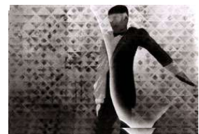
Across the Fields 1992