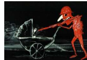
The Chain - The Horrors of War