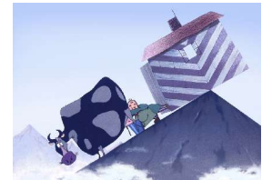
At the Ends of the Earth 1999