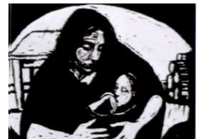
Death and the Mother 1997