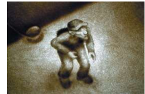
Clandestino 2000, sandanimation