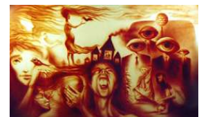
Stones Kövek 2000, Sandanimation