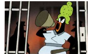
Penguins Behind Bars, 2003