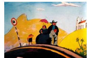
The blue Kingdom 1989