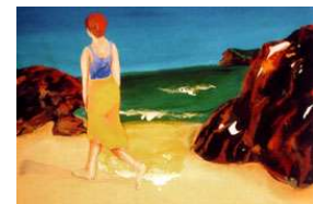
Small Treasures 1995