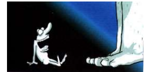
Power Play 2004